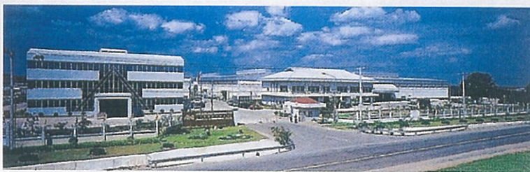
AEROFLEX INTERNATIONAL CO., LTD. HEAD OFFICE & FACTORY RAYONG THAILAND